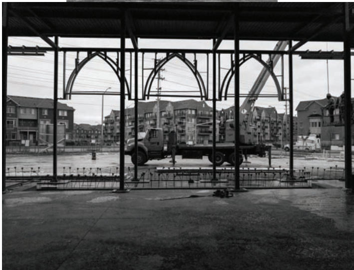
Update on the Construction of the Church